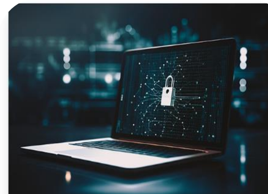
Threat and Anomaly Detection