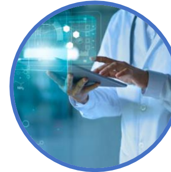
Digital Health and Wellbeing