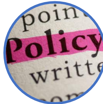
Evaluation of Public Policies