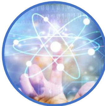
Theoretical Studies in Nuclear Physics and Related Areas