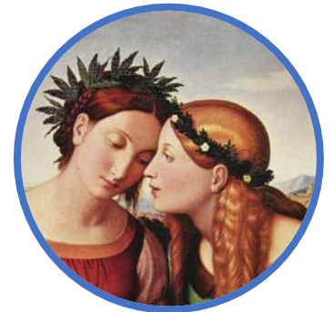
Italian-German Historical Institute