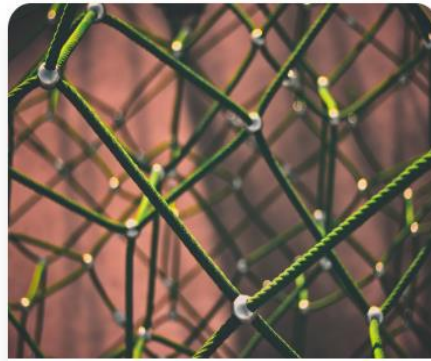
Cloud and IoT Security